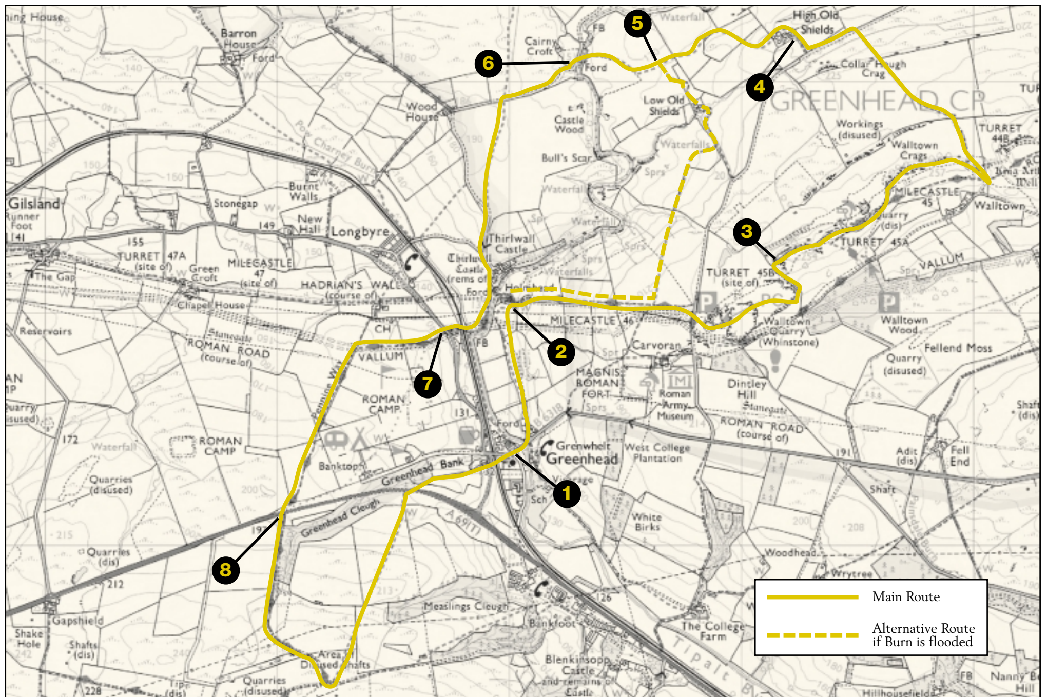
Copyright: Ordnance Survey (Explorer OL 43)

6. Cross the burn and turn left and follow the road up for about 250m and come to a footpath crossing the road – signposted. Turn left and across the field over two stiles and through the field gate onto the road. Turn left and continue down through a farm yard to come to Thirlwall Castle on your left.